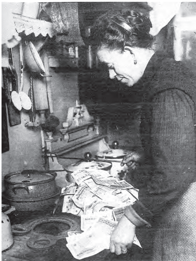
A woman using banknotes to start her fire in 1923.