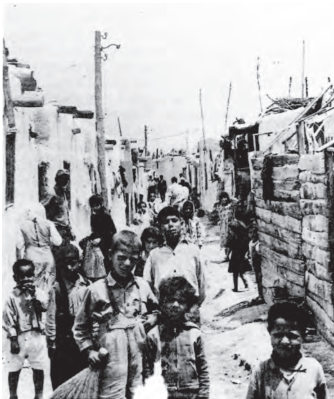
A street in a Palestinian refugee camp in 1966.

21 Study the photograph, and then answer the questions which follow.