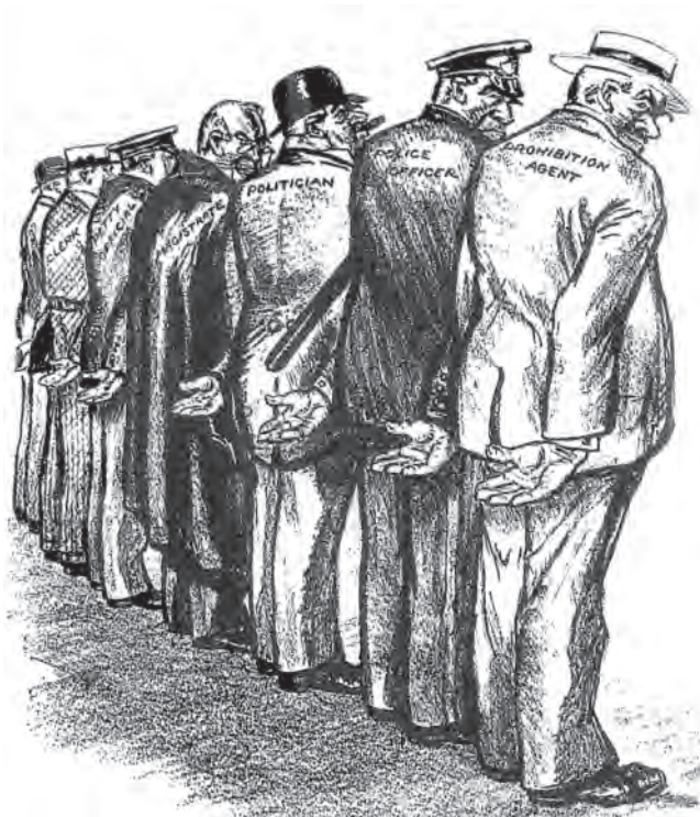
A cartoon from the Prohibition era entitled 'The National Gesture'.

13 Study the cartoon, and then answer the questions which follow.