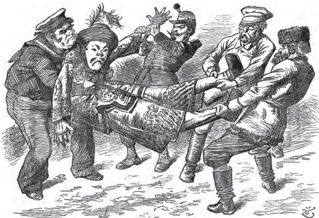
A cartoon showing foreign countries competing over China.

24 Study the cartoon, and then answer the questions which follow.