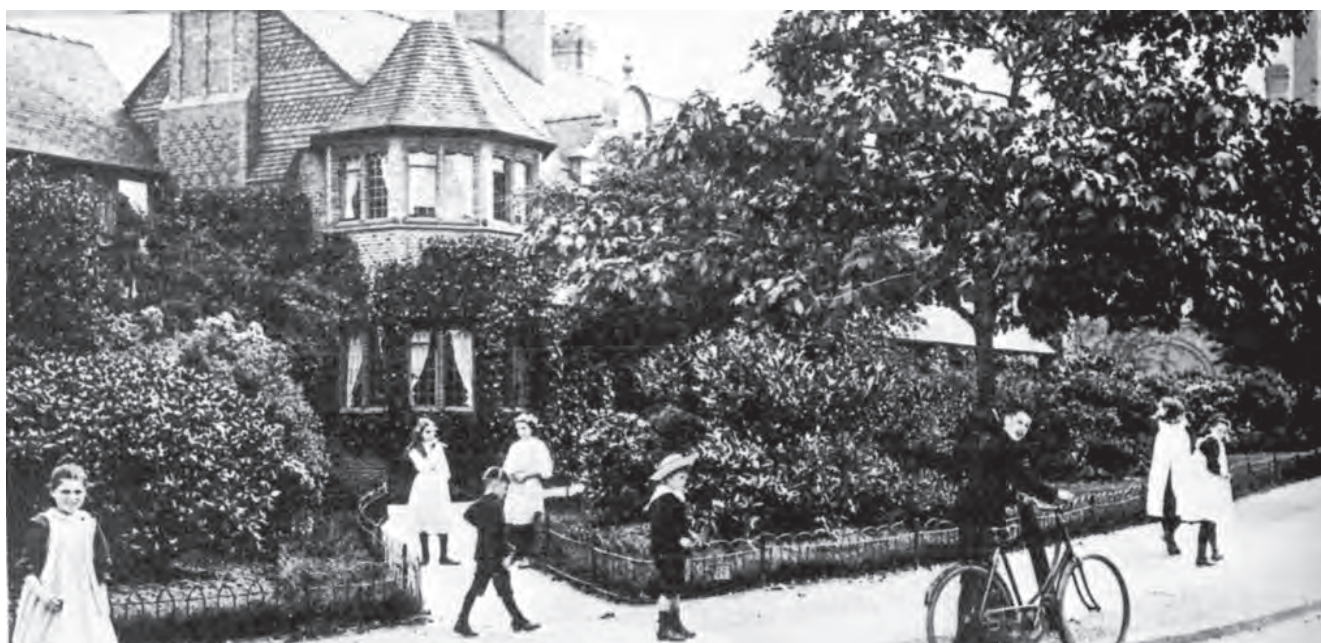
Workers' cottages built by Lever in the model village of Port Sunlight.

23 Study the photograph, and then answer the questions which follow.