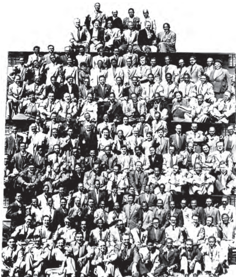
The accused at the start of the Treason Trials, December 1956.

18 Study the photograph, and then answer the questions which follow.